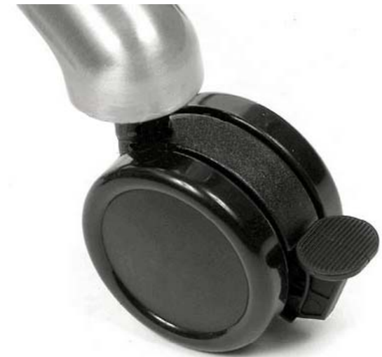
Moves easily with dual-wheeled casters. 3 casters include brakes for locking position.