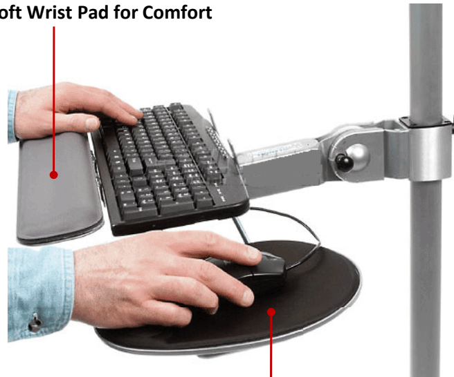
Mouse pad with soft wrist foam for comfort Retractable mouse tray that attaches to either side.