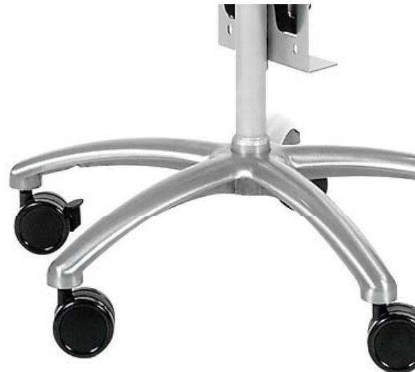
Light and stable Aluminum construction.