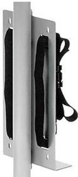
Strap CPU Holder assembles CPU tightly in easy way.