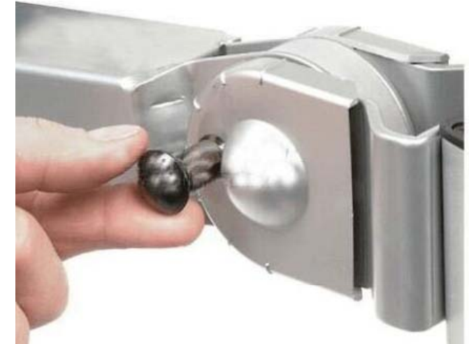
Keyboard & Mouse tray folds easily