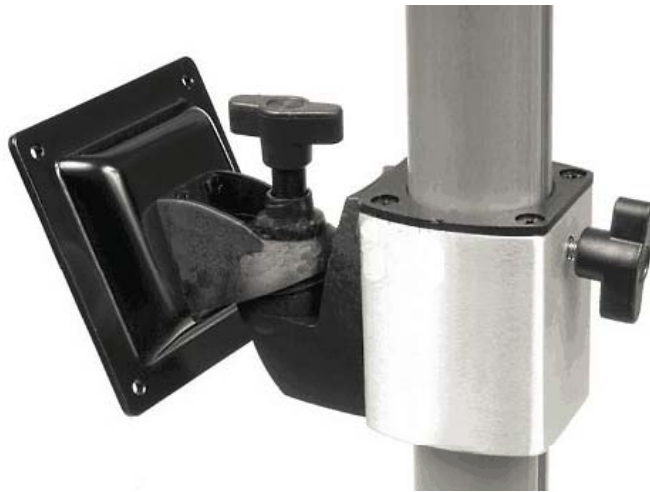
Monitor mount adjusts easily for optimal viewing; Height adjustable in easy way.